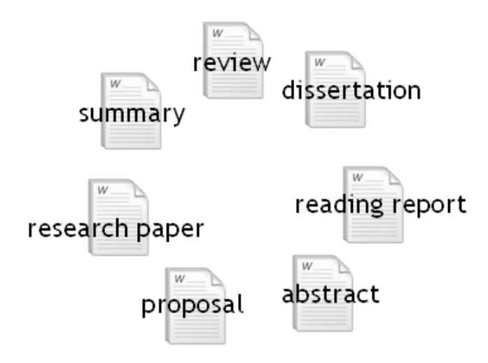
Figure 1. Academic text types in CALE

of each text type as to (a) structural features, (b) length, and (c) functional features. Table 1 illustrates the profile for the academic genre "abstract".